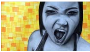
Pictures: Award-Winning Work Of Connecticut's Teen Artists