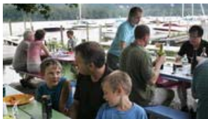
Pictures: Outdoor Dining In Connecticut