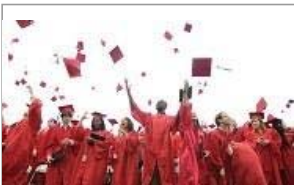
New England Commencement Speakers 2012

Serving CT for 35 years Call Today for a Free Estimate www.richlandpestbee.com