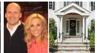
Famous Faces Buying & Selling Homes In CT