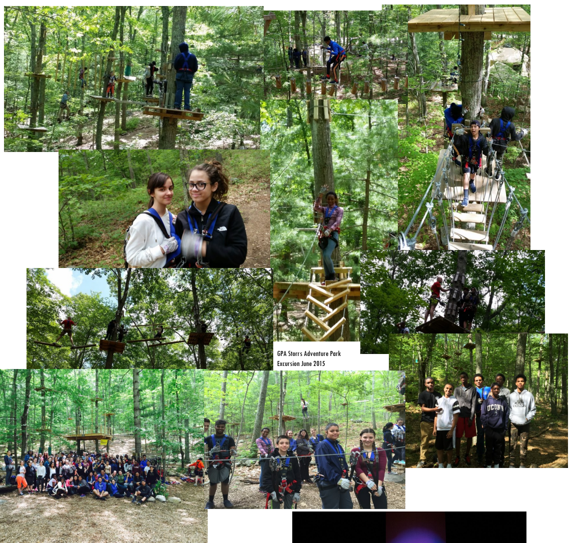
GPA Storrs Adventure Park Excursion June 2015