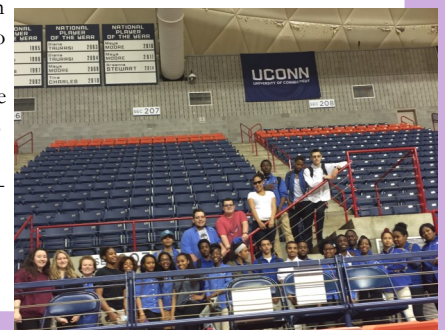
Above, GPA juniors explore UConn.