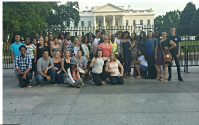
Above, GPA Students and Staff pose in front of the White House. To the left, the show at the Army Base.