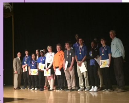
Above, the last 204-15 GPA Students of the Month accept recognition from Mega Education.